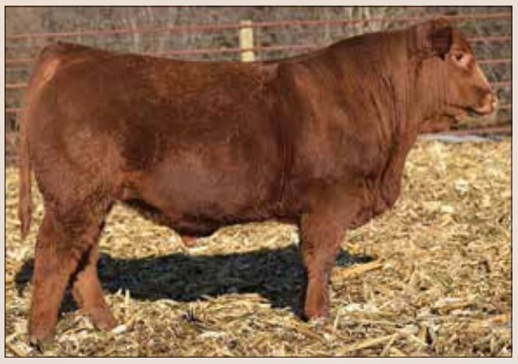
Maternal brother of Lot 20