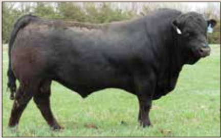
TREF COAL TRAIN Sire of Lot 31