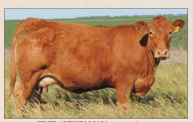
TREF AUBURN 915A ● Dam of Lot 17