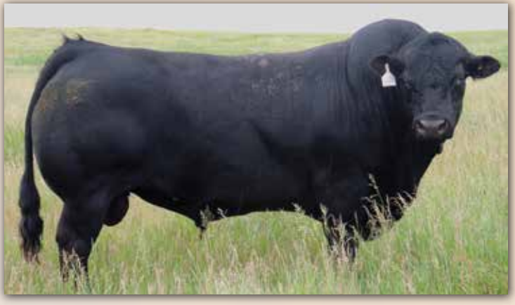
TREF DONE RIGHT 707D Sire of Lot 37