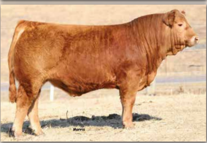
JBAR JEXCLUSIVE 704E ET • Sire of Lot 49