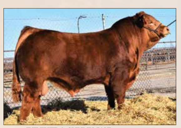
JYF EXTRA CHUNK 518E • Sire of Lot 25