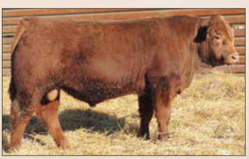
2013 maternal brother to flushmates