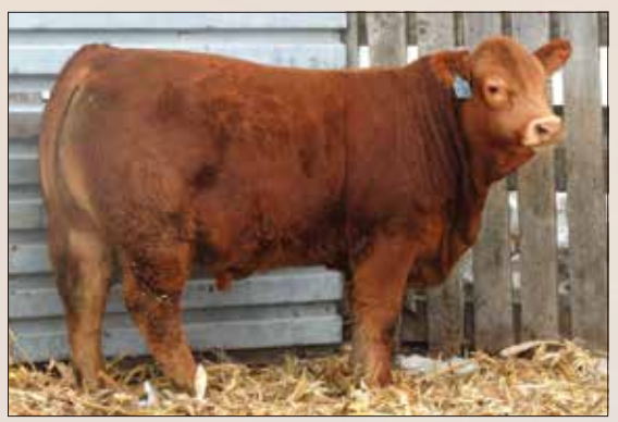
Full brother to Lot 29 selling to LAM Limousin in 2020