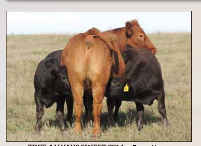
TREF ALWAYS SWEET 991A • Dam of Lot 11