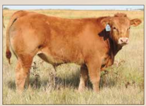
LOT 4 • Pictured in September