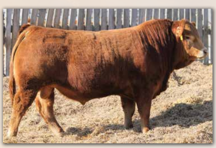
BBAR BENTLEY 8D Sire of Lot 41