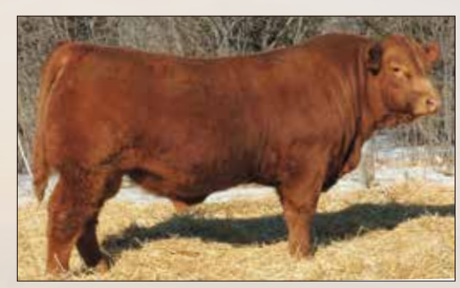
2015 maternal brother to flushmates