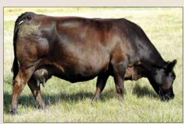
TREF ASIA 907A • Dam of Lot 32