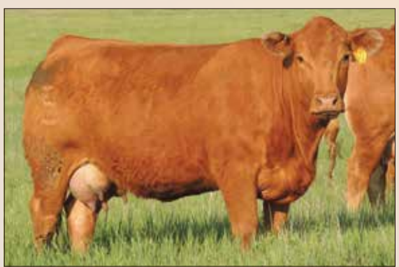
TREF CASSIDY 141C • Dam of Lot 18