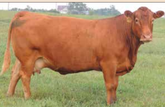
TREF BRIELLE 064B • Dam of Lot 10