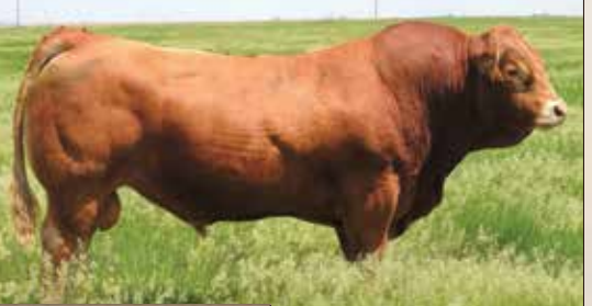
LOT 2 Pictured in November