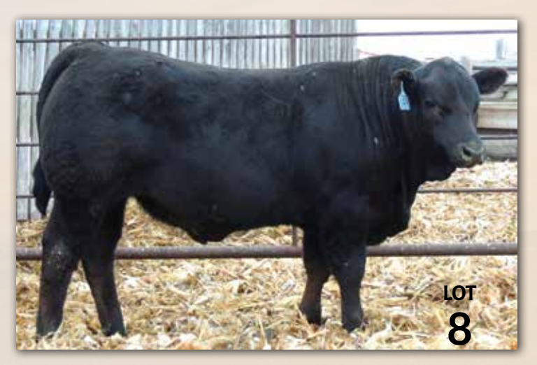
TREF DONE RIGHT Sire of Lots 6-8