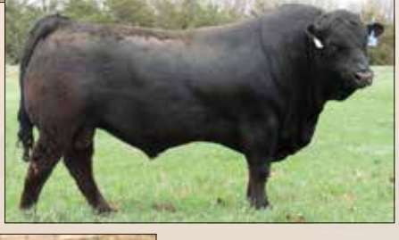
Pictured in November

TREF COAL TRAIN 707D Maternal grandsire of Lot 5