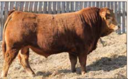
B BAR BENTLEY 8D Sire of Lot 5

TREF COAL TRAIN 707D Maternal grandsire of Lot 5