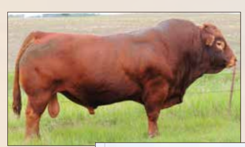
JYF YIELDMASTER Maternal grandsire of Lot 2