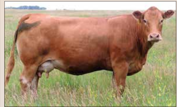
TREF BLING 091B • Dam of Lot 25