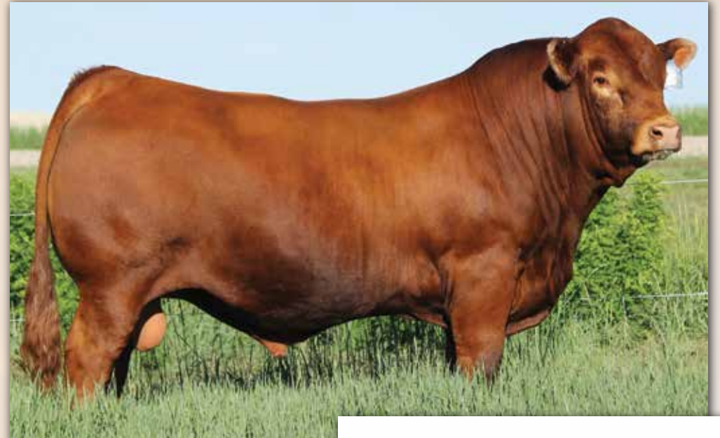
RPY PAYNES CRACKER 17E Sire of Lots 1A, 1B & 1C