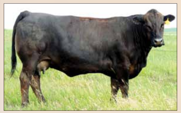
TREF ZAZU 892Z ● Dam of Lot 22