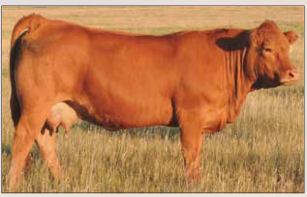
Maternal sister of Lot 19