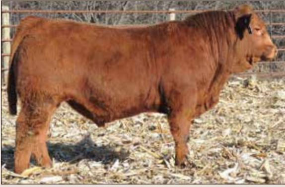
Maternal brother of Lot 16