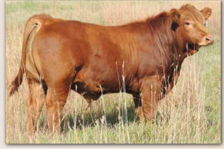
LOT 26 ● Pictured in August