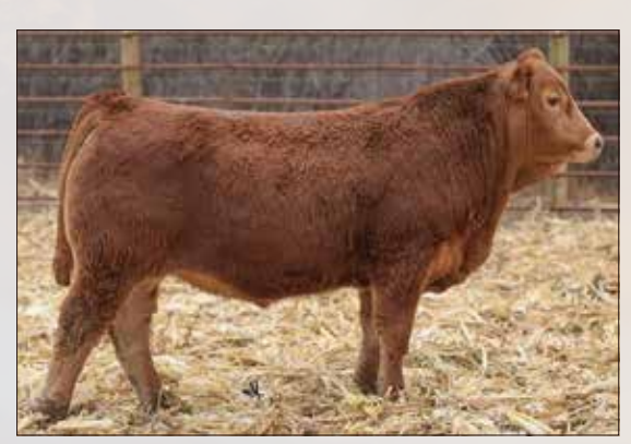
TREF EAZY STREET 107E • Maternal sister of Lot 23