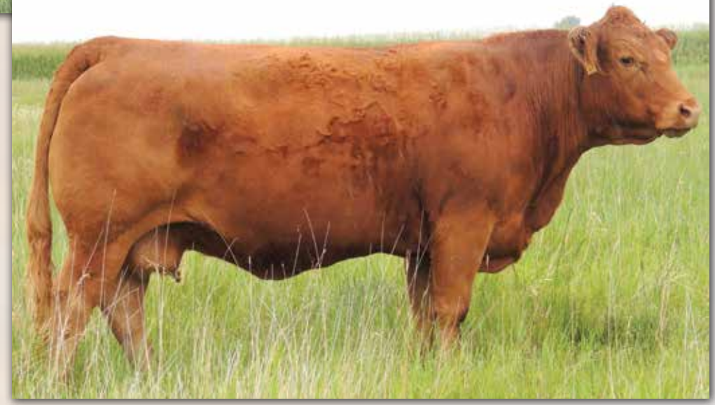
TREF YAKIRA 766Y Dam of Lots 1A, 1B & 1C